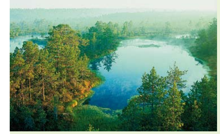
A MORNING IN JULY

Swamps cover 22.3% and bogs with a higher level of development cover 7.7% of the area of Estonia. The generation of swamps can widely be divided into two: 1) generation of a swamp from a water body; 2) accumulation of water in an initially dry spot, as a result of which a swamp forms.