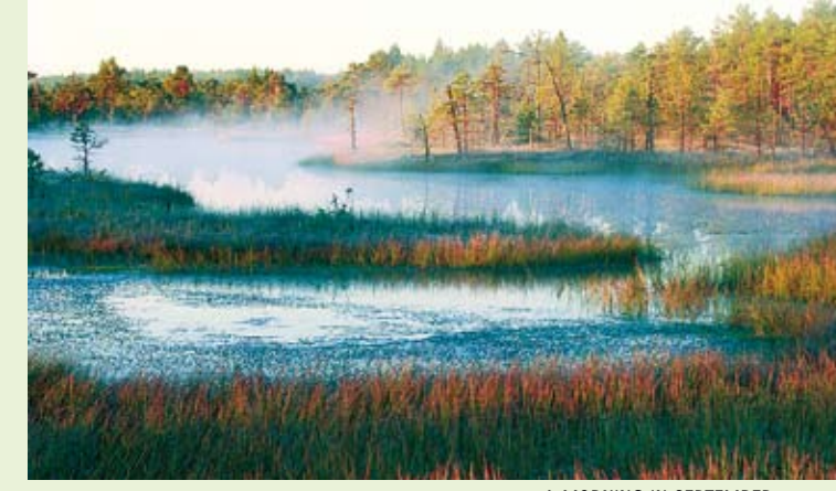
A MORNING IN SEPTEMBER

take advantage of the existence of bog pools - they nest on bog islands.