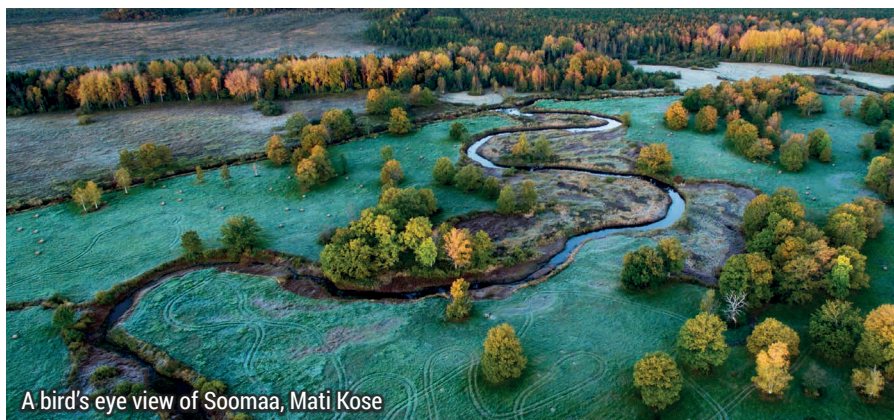
A bird's eye view of Soomaa, Mati Kose