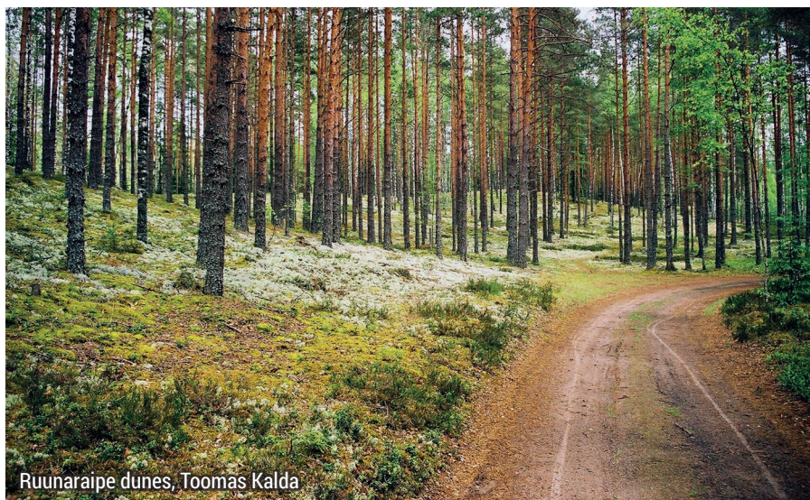
Ruunaraipe dunes, Toomas Kalda

The forests in Soomaa are home to large predators, such as the lynx, wolf and brown bear, as well as other species native to Estonia, such as the elk, roe deer and wild boar. Mire forests and meso-eutrophic forests are inhabited by such species as the black stork, Ural owl, boreal owl, black woodpecker and three-toed woodpecker.