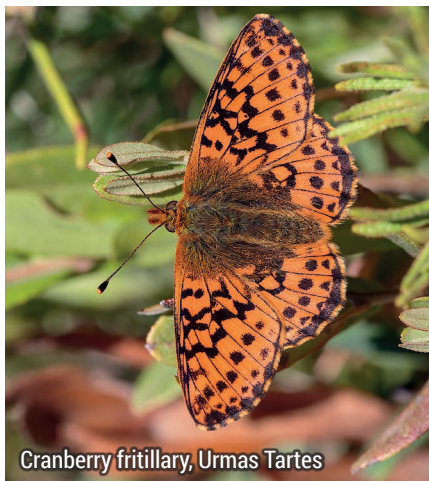
Cranberry fritillary, Urtica cardui

Despite its relatively flat relief, the region of Soomaa is one of diverse habitats. Over 80% of its surface area is taken up by marshland habitats, such as raised bogs, transitional mires, fens, paludified meadows and mire woodland. The mires in the national park started to form after the region became free of glacial ice, some 13,000 years ago. Once there was a huge lake on the border of Pärnu and Viljandi counties. In low-lying areas, subsiding waters created bodies of water which later turned into mires. Today, large mires have reached the development stage of bogs.