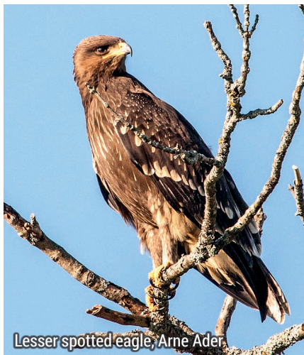
Lesser spotted eagle, Arne Ader

The RMK Oandu-Ikla hiking route, running from one side of the country to the other, passes through Soomaa National Park. The section going through the park measures 56 km.