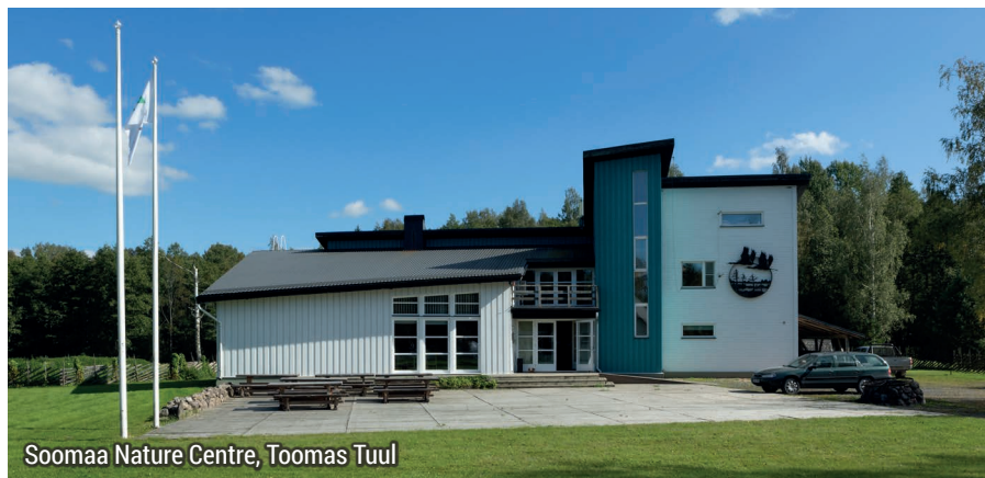
Soomaa Nature Centre, Toomas Tuul

The RMK Soomaa Nature Centre ⑧ is in Kõrtsi-Tõramaa. Established in 1998, the centre was built on the former site of Naari Inn. To obtain information on the sights, hiking trails and campfire sites in the national park or to get answers to any questions related to visiting Soomaa, visitors are welcome at the centre. Here you can take a look at themed exhibitions, information displays, a photography exhibition entitled 'The Fifth Season 2010' and nature movies.