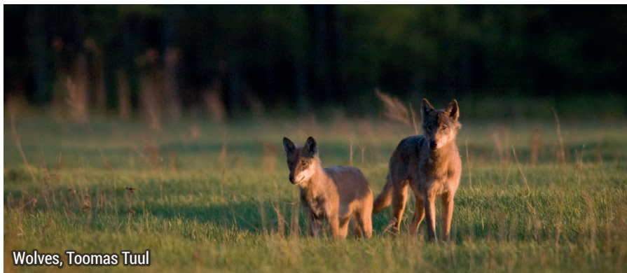
Wolves, Toomas Tuul