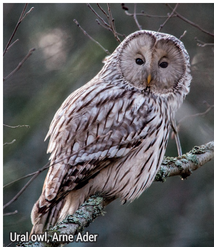
Ural owl, Arne Ader