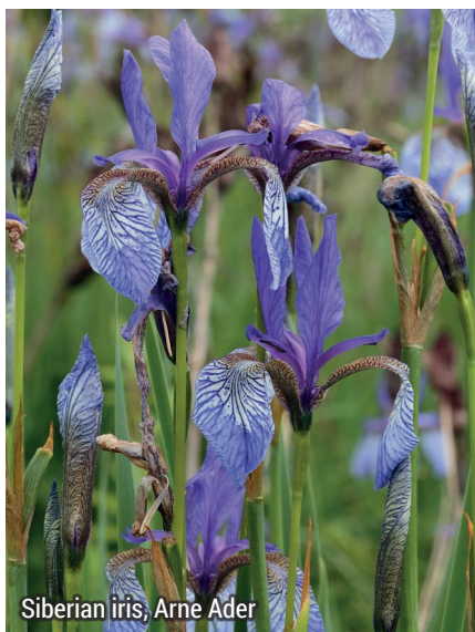
Siberian iris, Arne Ader

Alluvial forests are periodically flooded by rivers. Broad-leaved trees, such as elms, oaks, lindens, ashes, maples and European white elms, grow in alluvial forests, which are becoming increasingly rare in Estonia. Typical examples of such forests are Pääsma woodland ④, Karuskose alluvial forest and Lemmjõgi forest ( keelemets ). Grassy areas on the forest floor host a variety of species. Here you can come upon wild garlic, species of the Corydalis genus and dog's mercury. Alluvial forests