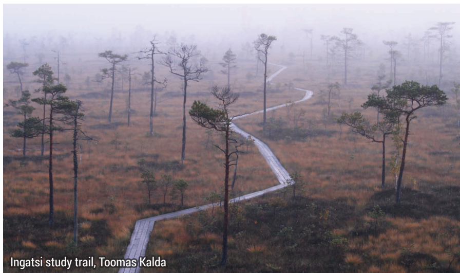
Ingatsi study trail, Toomas Kalda

This trail is accessible to pedestrians, wheelchair users and parents with prams. The length of the trail section for visitors with impaired mobility is 1.22 km (one way). The trail's starting point is readily accessible, being located on the Kõpu-Jõesuu road. The trail goes in a circle and there are information boards along the way, providing additional details about it. The trail winds its way through a picturesque bog and forests along the Navesti River. From the observation tower you can admire the views over clusters of bog pools and enjoy the silence of the bog.