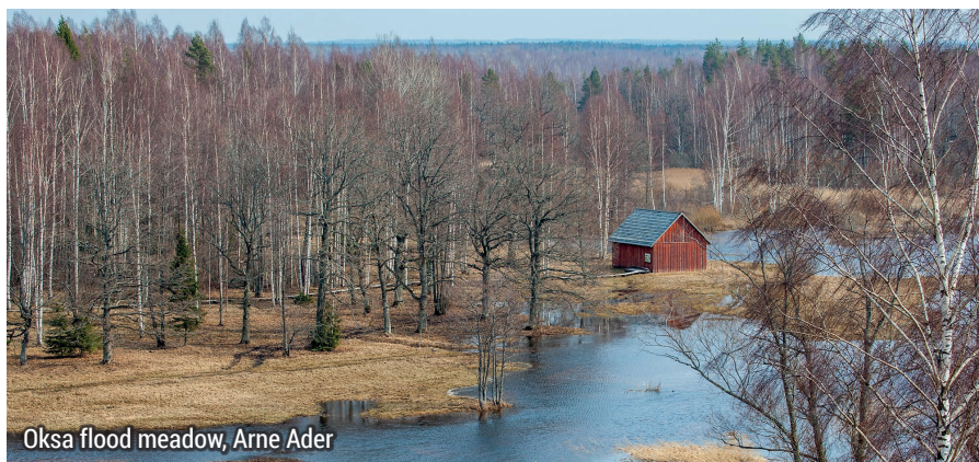
Oksa flood meadow, Arne Ader