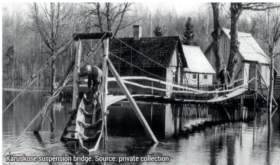
Karuskose suspension bridge.

The former village of Toonoja (currently part of Karjasoo) is situated in the middle of Kuresoo bog. It was established in the early 19th century. At that time it included six highly viable farmsteads. The last resident left Toonoja in 1987. Currently only a couple of farmstead ruins, a root cellar and a farm building in Mardi are all that is left of the once thriving village.