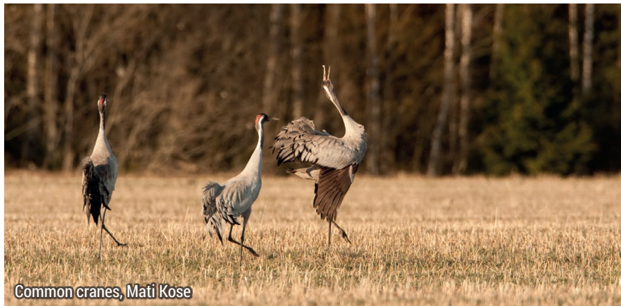
Common cranes

Soomaa has been categorised as an Important Bird and Biodiversity Area (IBA) since 1989. Also, it was added to the List of Wetlands of International Importance, or the Ramsar List, in 1997, and it joined the Natura 2000 network of protected areas in the European Union as a habitat and bird site in 2004.