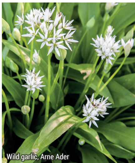
Wild garlic, Arne Ader

are a habitat for a number of bird species, including the rare white-backed woodpecker and the middle spotted woodpecker.