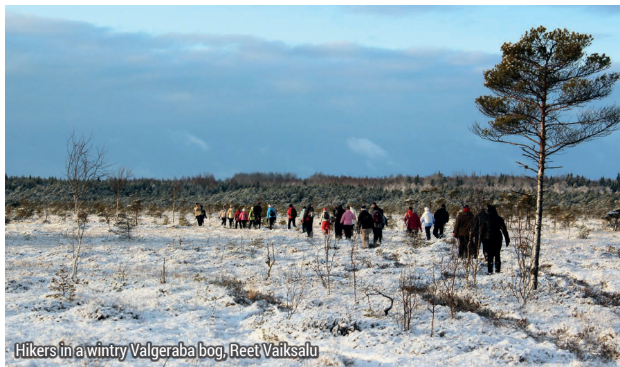
Hikers in a wintry Valgeraba bog, Reet Vaiksalu