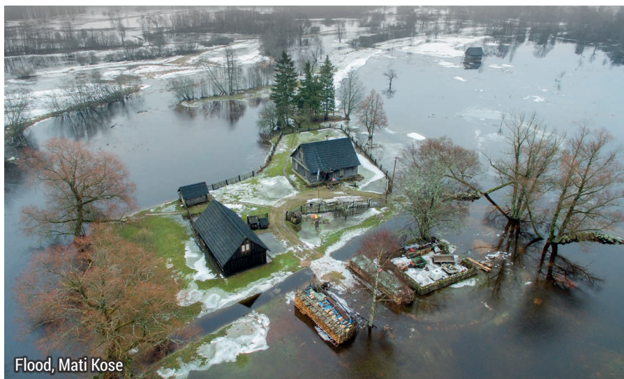
Flood, Mati Kose