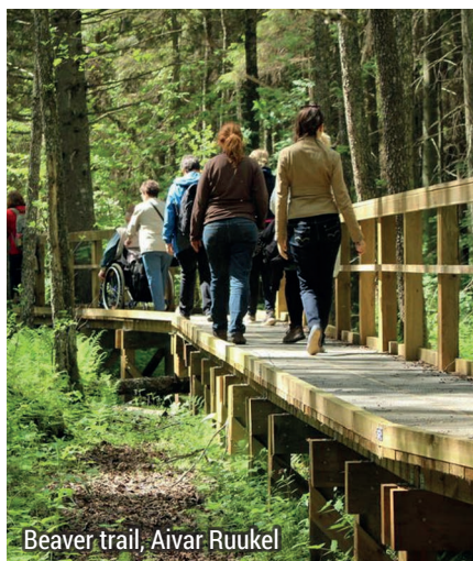
Beaver trail, Aivar Ruukel

This trail is accessible to pedestrians, wheelchair users and parents with prams. The length of the trail section for visitors with impaired mobility is 0.66 km (one way). The trail winds its way through various types of forests: a shady spruce forest; a forest of birches and ferns, full of light; and a wet mire forest. While on the trail, visitors may spot the beavers living by Mardu Brook and admire meadows which are periodically flooded. There are information boards along the circular trail.