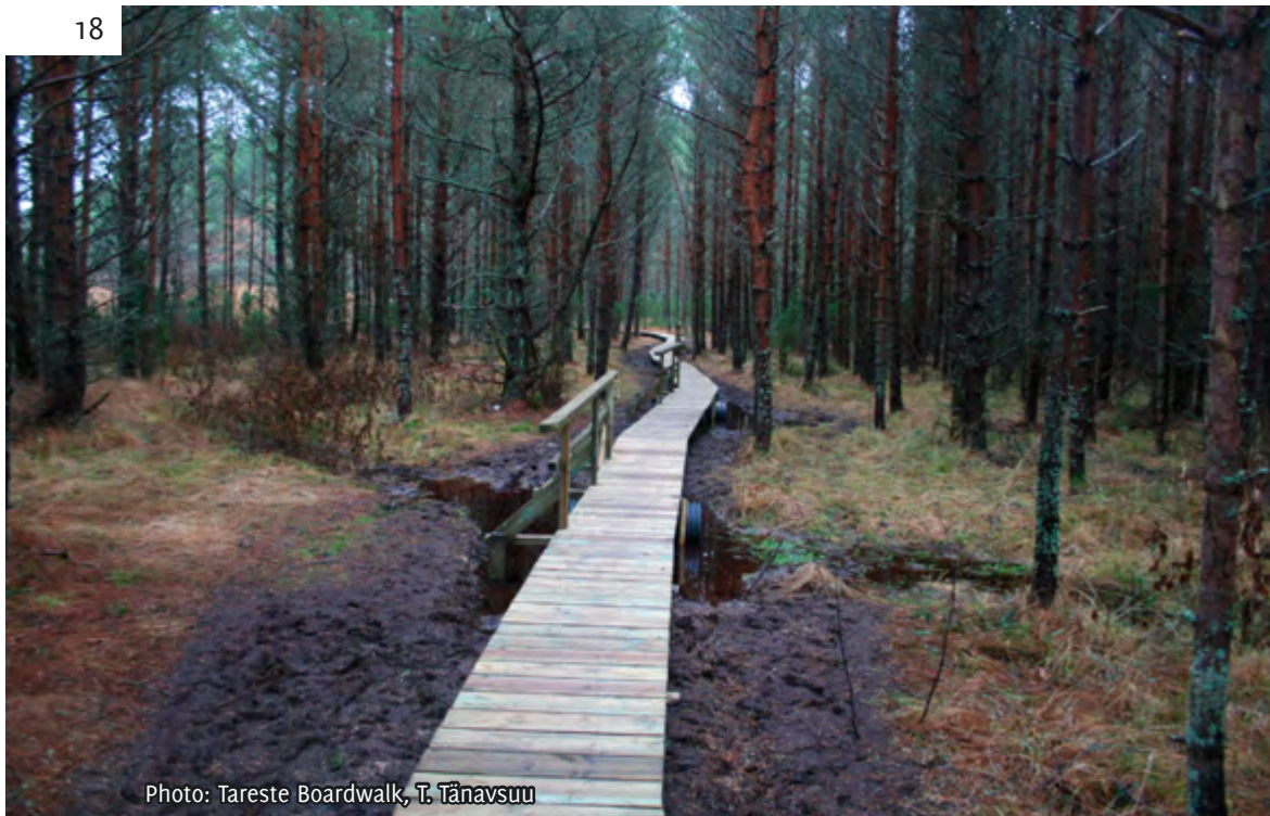
Photo: Tareste Boardwalk