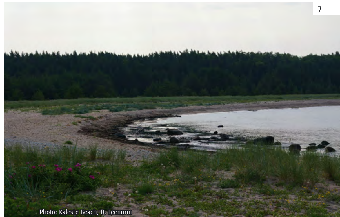
Photo: Kaleste Beach

Habitat of Putkaste Yews / Leluselja Yews Sanglepa ( Black Alder ) Alley (4.7 km)