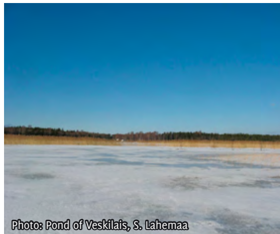
Photo: Pond of Veskilais, S. Lahemaa