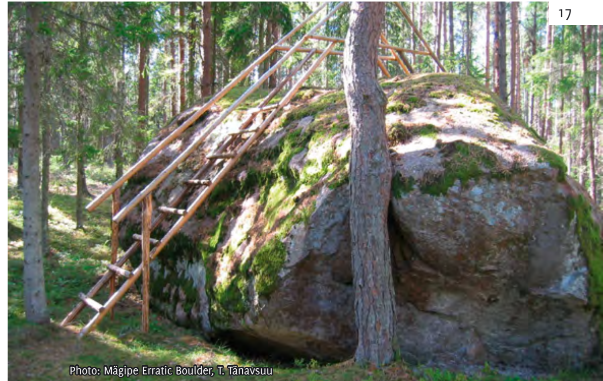
Mägipe Erratic Boulder

The RMK Rebastemäe Study Trail with the length of 1.5 km introduces different types of forests and other habitats.