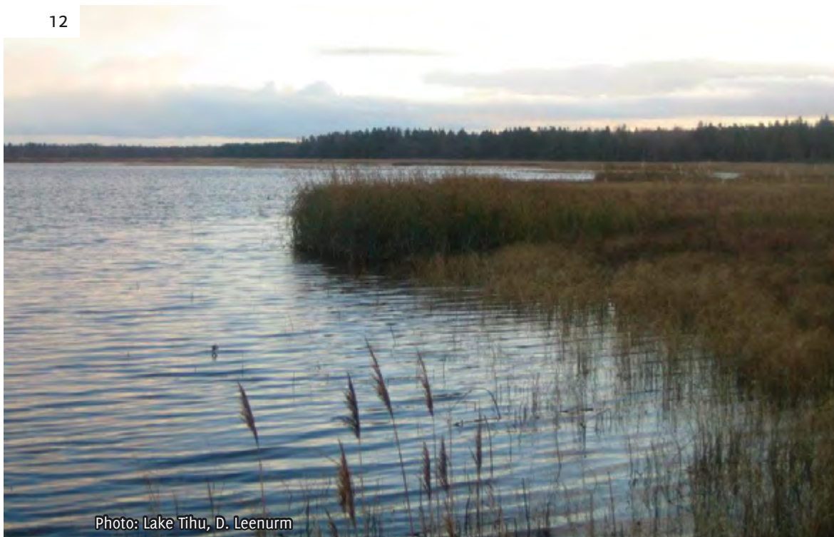
Photo: Lake Tihu