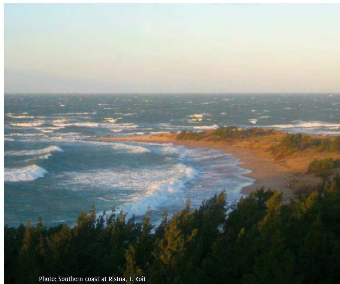
Photo: Southern coast at Ristna