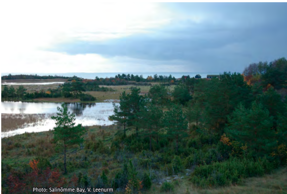
Photo: Salinõmme Bay