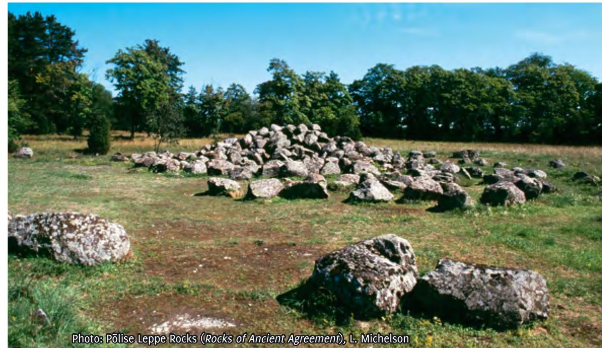
Põlise Leppe Rocks ( Rocks of Ancient Agreement)