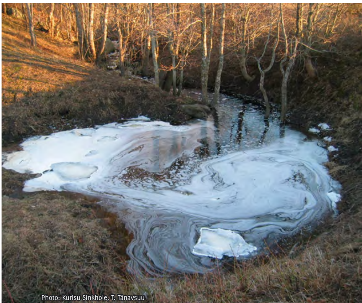
Photo: Kurisu Sinkhole