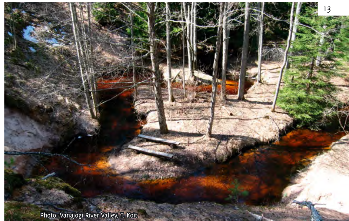
Photo: Vanajõgi River Valley

The protected species of plants growing here include the bog orchid, coral-root orchid, lesser twayblade, European yew, and broad-leaved helleborine. Several rare species of insects, such as the large white-faced darter, lilypad whiteface, and scarce heath, live in the Tihu Nature Reserve. The protected area is a habitat for the European mink.