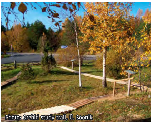
Photo: Orchid study trail

On the RMK Kõrgessaare Orchid Study Trail ten species of orchids grow in the natural way. The first to bloom in late May or early June are military orchids, followed by lesser butterfly and early marsh orchids. The last to flower in August are the dark red and marsh helleborines.