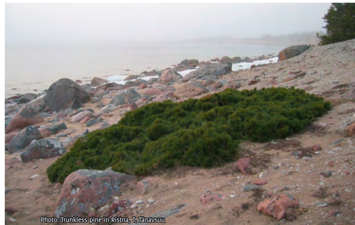
Photo: Trunkless pine in Ristna

This publication gives a survey of the county's protected natural objects, their locations and values.