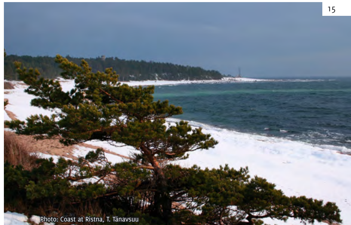
Photo: Coast at Ristna

THE PAOPE NATURE RESERVE covers 2,215 hectares (incl. 1,601 ha under water). The protected area aims at conservation of the coastal and marine ecosystems, and of the biodiversity of meadow, forest and freshwater communities. An approximately 600-hectare-large ebb area, “sown over” with erratic boulders, lies in the Paope Conservation Zone.