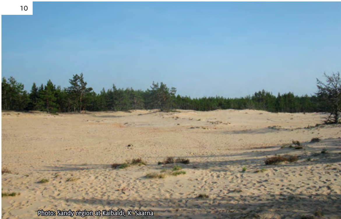
Photo: Sandy region at Kaibaldi