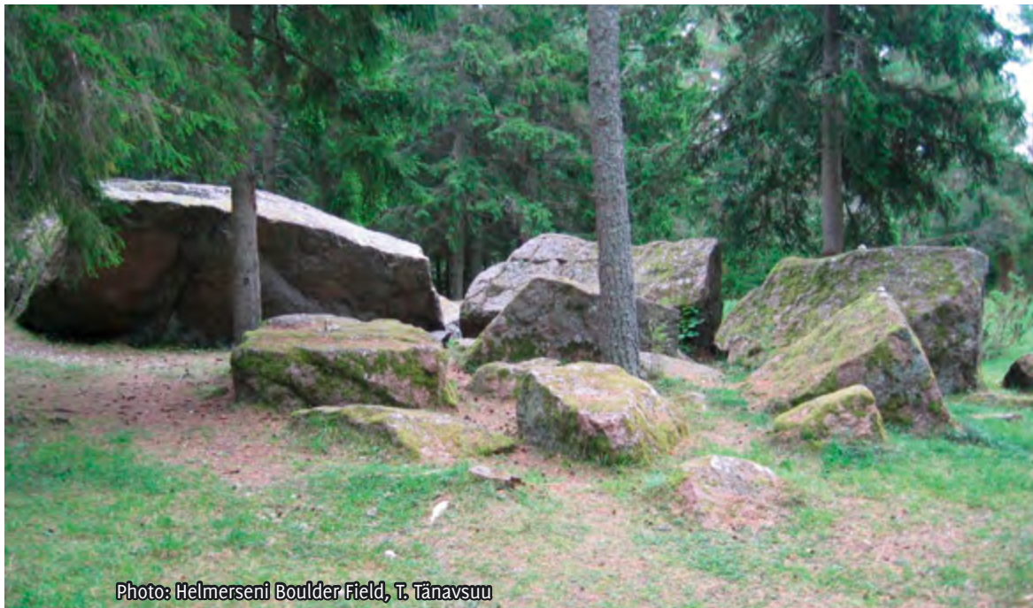
Photo: Helmerseni Boulder Field