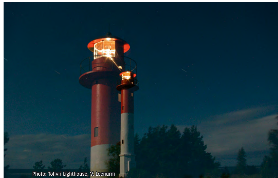
Photo: Tohvri Lighthouse