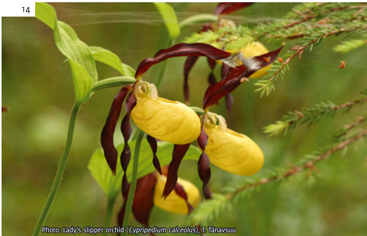
Photo: Lady's slipper orchid ( Cypripedium calceolus )

On the RMK Kõrgessaare Orchid Study Trail ten species of orchids grow in the natural way. The first to bloom in late May or early June are military orchids, followed by lesser butterfly and early marsh orchids. The last to flower in August are the dark red and marsh helleborines.